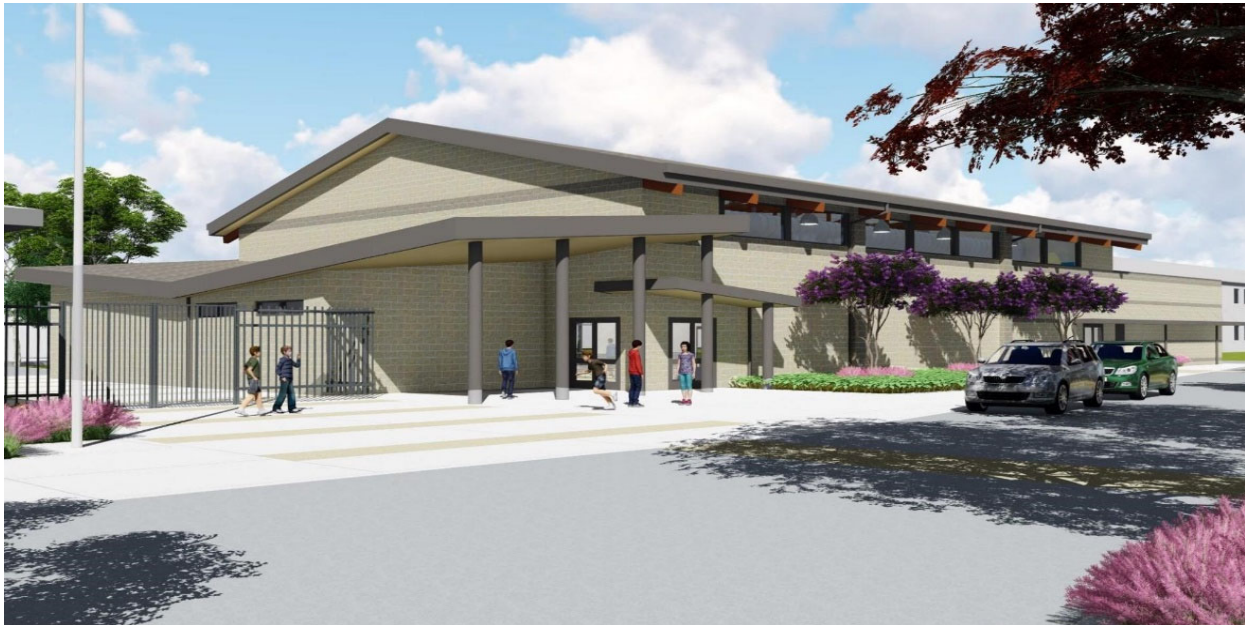
Concept picture of new Multi -Purpose Building

New 11,492 sf multi-purpose building, parking lot and play court area. The gym will contain a full size junior high regulation basketball court and 2 practice cross courts with motorized goals. The bleachers will accommodate 182 spectators plus 5 wheelchairs. The kitchen will be capable of serving 1,500 meals per day. There is a boys' and girls' restroom plus an extra room for table and chair storage.